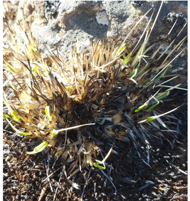
Figure 2. Regrowth of burned bunchgrass from plant crown.