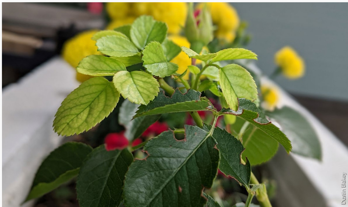
Miniature rose growing in alkaline soil showing symptoms of a nutrient deficiency.