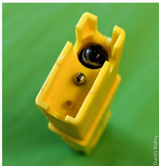
Figure 2. Typical electrode probe of a digital pH meter.

Digital meters can be purchased online or at tool supply stores for less than $20. Many devices are marketed as pH meters, but not all measure pH accurately. For the most reliable results, look for a device with a probe consisting of a glass orb and a small piece of metal at the end, similar to the item shown in figure 2.