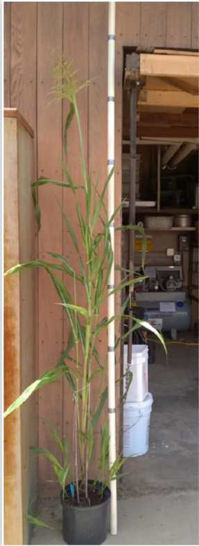
Figure 7. Johnsongrass can reach 8 feet in height.