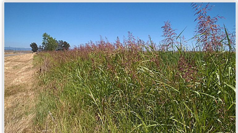
Figure 6. A large roadside johnsongrass infestation.