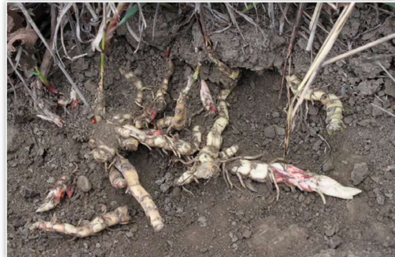
Figure 5. Cluster of johnsongrass rhizomes. Note the scaly texture and cream to red color.