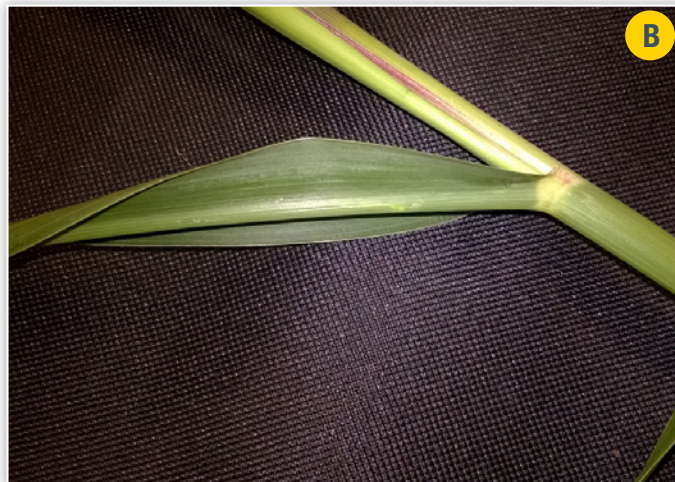
Figure 9. A: White midvein and an emerging leaf rolled in the bud. Note the purple tinge beginning to show on the internode. B: Prominent midrib on leaf underside.