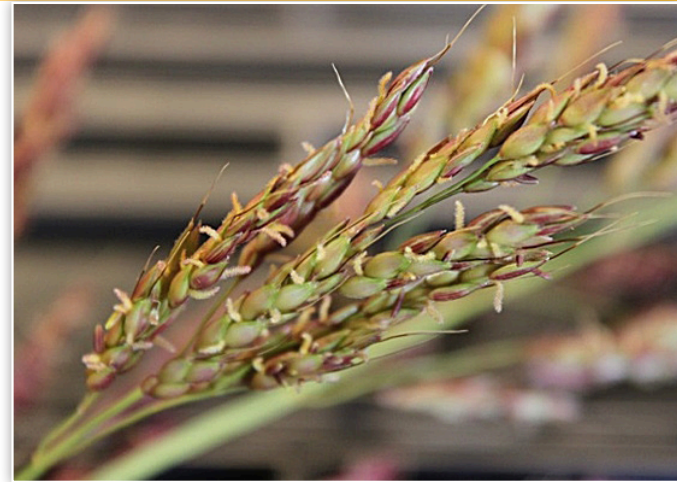
Figure 4. Johnsongrass rachis: flowering spikelets; awns are visible on sterile spikelets.

Johnsongrass seedlings can resemble young corn seedlings, but because their seed remain attached, johnsongrass is easily discernable if plucked. The first leaf is usually parallel to the ground; early leaves have a smooth surface with no discernable midrib and smooth edges. A white midvein may begin to show at the leaf base of seedlings. Seedling collars are usually pale green to whitish, and sheaths may begin to take on a red-purple tinge as the plant matures.