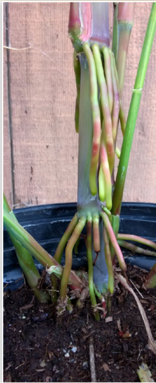
Figure 8. Johnsongrass prop-roots and aerial roots.

In California, johnsongrass can be as much as 8 feet tall at maturity (Fig. 7). Stems grow from the crown, are erect and unjointed at the nodes, and may have a red-purple base or tinted internode. Nodes may have some fine hairs, but internodes are usually smooth. Prop roots may form near the base of stems (Fig. 8). The leaves are rolled in the bud, generally emerge flat, and have a prominent midrib, especially at the base (Fig. 9). Mature leaves are hairless to nearly hairless and may have slightly rough edges, with a prominent fringed ligule up to 0.2 inch long or more (Fig. 10). Sparse hairs may be present on the leaf or sheath near the collar. Inflorescences form as large, open panicles that are pyramidal or conical in shape. Spikelets can range from pale green or gray to golden to purple-brown. They may remain on the