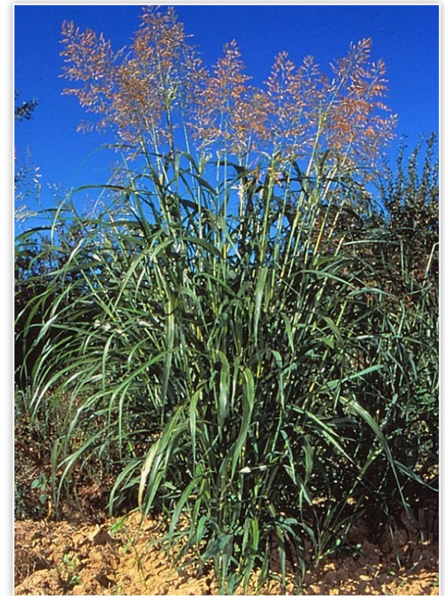
Figure 1. Mature johnsongrass stand.