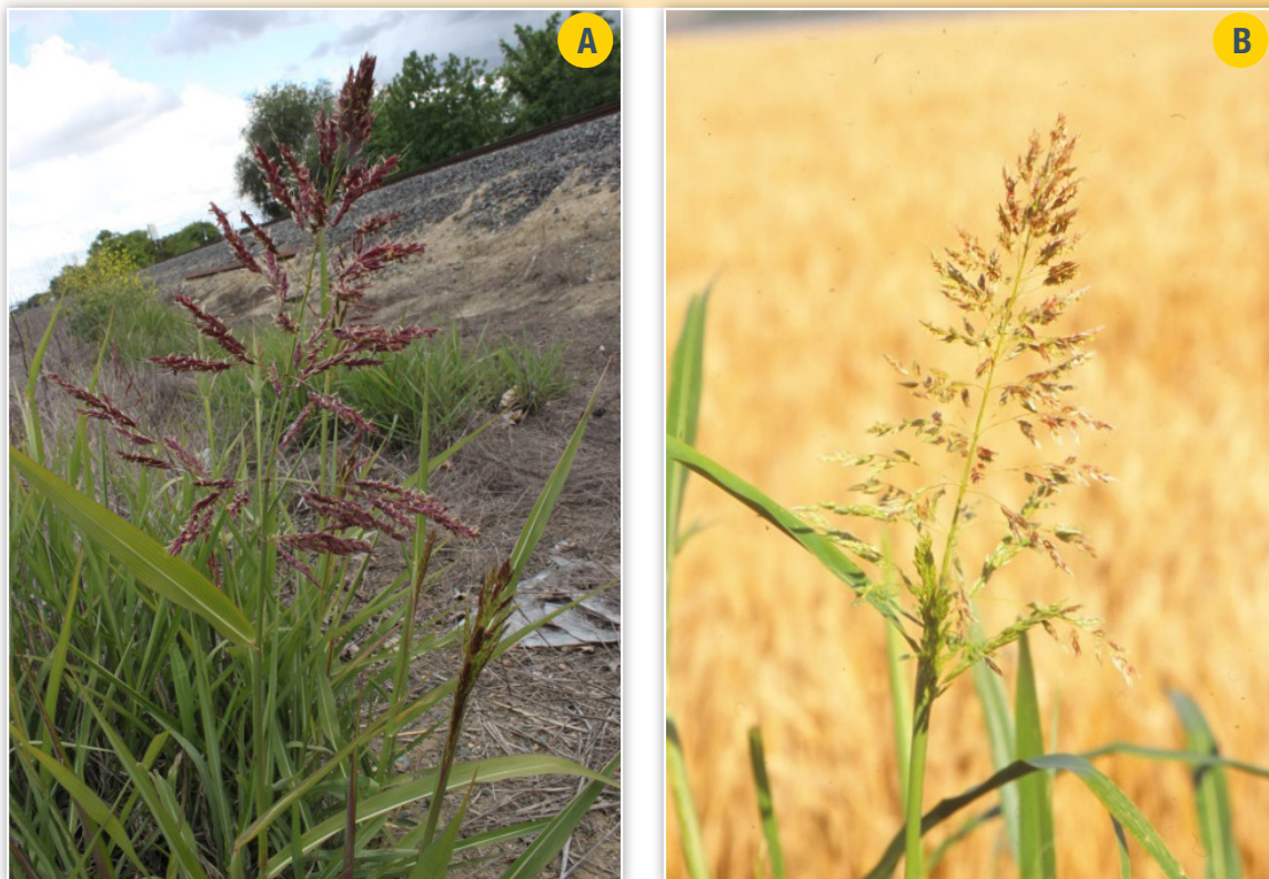
Figure 2. Johnsongrass panicles. A: Early-season panicle. Note emerging panicle in background. B: Mature panicle.

Johnsongrass establishes well in disturbed areas, rangelands, pastures, abandoned fields, and canals, as well as in virtually any cropping system. It thrives in moist environments, but due to its extensive rhizome system it can persist in drier topsoils if they are above high water tables. Johnsongrass may not be a significant threat to recovered areas with sufficient established vegetation, so avoiding disturbance in these areas is critical to preventing new or repeat infestations. Infestations usually begin in the margins of affected areas, but livestock and machinery may inadvertently spread seed to the interiors of fields, orchards, pastures, and other areas. Johnsongrass is an alternate host to Maize Dwarf Mosaic Virus (MDMV), which affects corn ( Zea mays ), oats ( Avena sativa ), millets such as pearl millet ( Pennisetum glaucum ) and foxtail millet ( Setaria italica ), and sorghum ( Sorghum bicolor ). The presence of the virus in crops is often attributable to a nearby johnsongrass infestation. It also readily hybridizes with grain, forage, or sudangrass sorghums, which can reduce harvest quality due to contaminated seed.