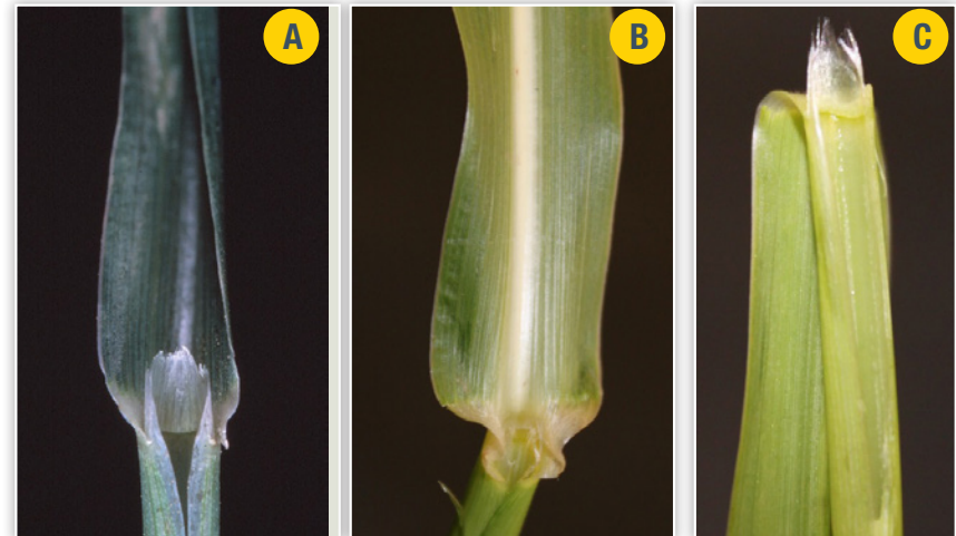
Figure 10. Johnsongrass ligules are variable. A: A prominent membranous ligule. B: An almost totally hidden ligule, which is composed entirely of fringe. C: A partially hidden fringed membrane ligule.

panicle or shatter into pairs or trios that consist of a lower fertile spikelet and one or two sterile upper spikelets. Fertile spikelets are 0.15 to 0.25 inch long, and the smaller sterile spikelets may have bent and twisted awns up to 0.6 inch long (see Fig. 4)). Rhizomes are branching, scaly, and fibrous, 0.5 inch or more in diameter, and reach up to 6 feet long. Rhizomes are usually cream or tan, may have reddish brown streaks, and form a dense sod by the end of the season (Fig. 11).