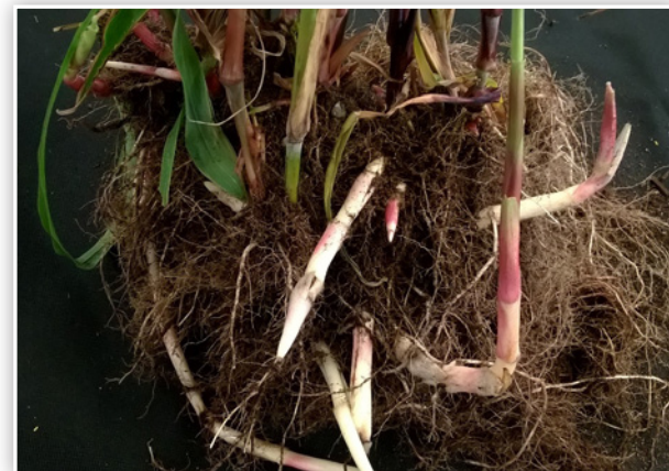
Figure 11. A sod of johnsongrass rhizomes.