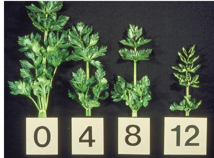
Figure 1. Osmotic effects showing decreased growth of celery as EC of the added salts in the soil water increases from 0 to 12 dS/m.

The most common whole-plant response to salt stress is a general stunting of growth. This is an osmotic effect. As salt concentration in the root zone increases above a threshold level (ECt), both the growth rate and ultimate yield of the crop progressively decrease. The salt-stressed plant is smaller than non-stressed plants but otherwise appears healthy unless salinity is extreme (see fig. 1). However, the threshold and the rate of growth reduction vary widely among different crop species. In a field of annual crops, the canopy may take on a wave-like appearance, and barren spots may be observed. This is largely due to the variability of soil salinity across the field.