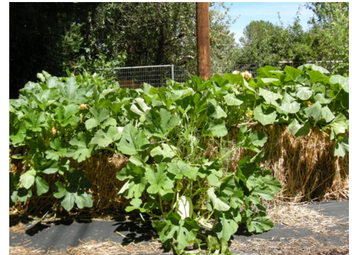
Straw bales in midseason.

Straw is baled from the dry stalks (culms) that remain after seed heads have been harvested from a grass crop such as wheat. They are not intended for consumption by animals. Ideally, straw bales come from a clean, weed-free field and will be free of seeds.