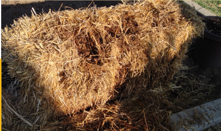
Figure 2. Damage to a straw bale treated with fish emulsion during conditioning by a raccoon.

frequent but small additions until the bales are saturated. At that point the bales are planted and liquid feed continues at every watering; 1.5 teaspoons (7.5 mL) of 24-8-16 in 5 gallons of water (19 L) will approximate his method.