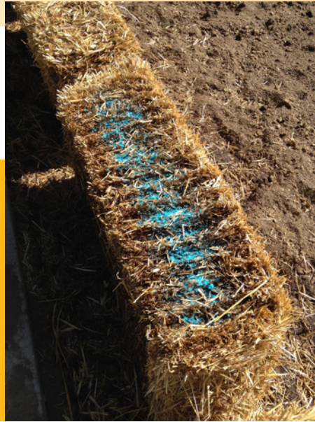
Figure 1. Apply fertilizer material across the top of the bale before watering.

For optimal composting, a ratio of carbon to nitrogen of 30:1 should be present; however, on their own, straw bales have ratios ranging from 40:1 to 100:1. As a gardener adds fertilizer containing nitrogen, the ratio approaches the ideal. Active composting will then begin. This composting process generates carbon dioxide and a substantial amount of heat. A fresh, 3-string straw bale can exceed 140°F (60°C) during conditioning. Older, seasoned bales may not exceed 100°F (38°C), but should still be preconditioned before use.