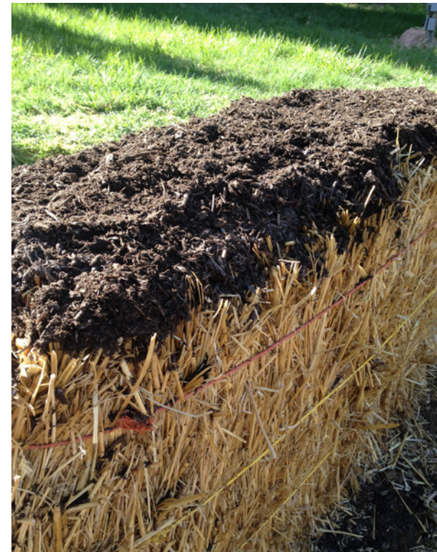
Figure 4. A conditioned bale ready for planting seeds.

As with any garden, plants should be spaced with enough room for them to grow. Planting suggestions for common warm-season vegetables are provided in table 4. For other crops, follow space recommendations printed on seed packets or consult a garden reference to guide you.