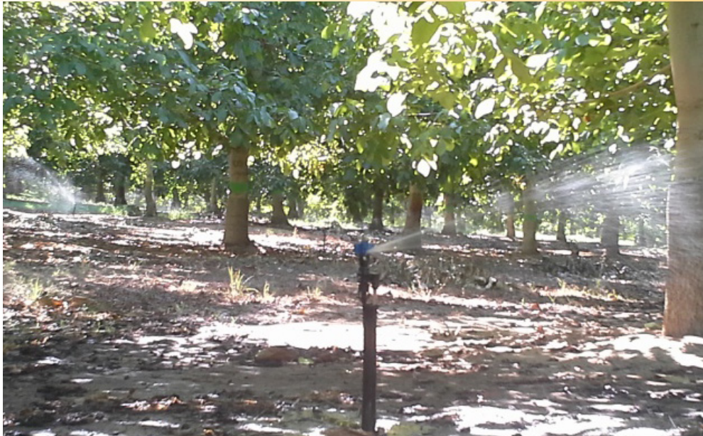
Figure 3. Mini-sprinkler irrigation, a common method of irrigating walnuts.

(1.8 acre-feet per acre, or about 50% of ET), the strategy might be to apply 50% of the monthly ET levels shown in figure 1. Also, consider monitoring tree water stress and attempt to keep pressure chamber levels between -8 to -12 bars as much as possible.