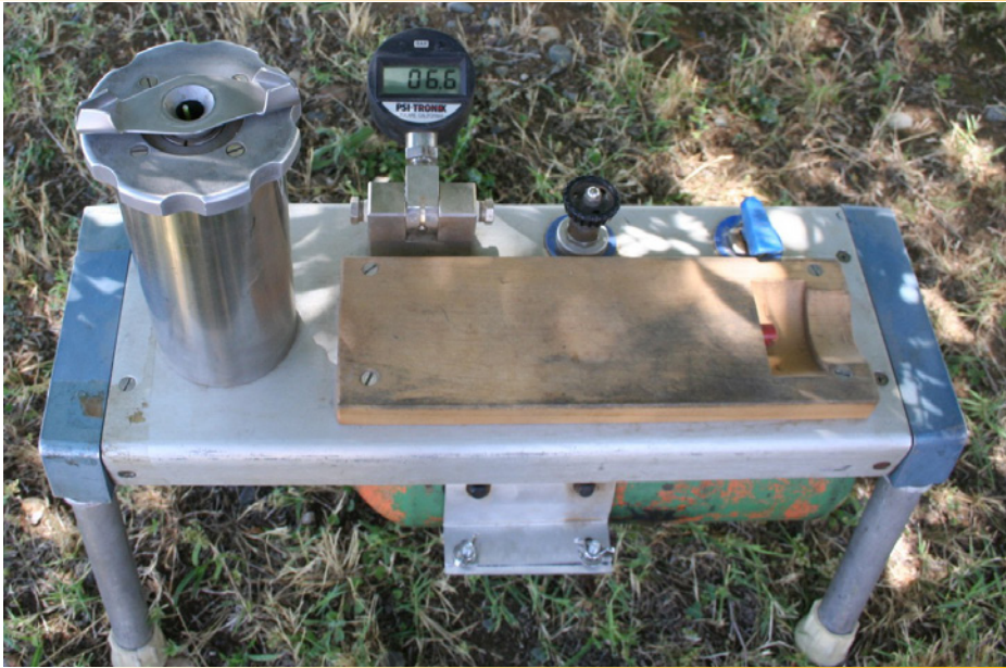
Figure 2. A pressure chamber on which the digital gauge shows -6.6 bar tree stress. Some walnut growers use this device to detect tree water stress and determine irrigation needs.

this time. Monitoring orchard stress with a pressure chamber and keeping tree stress in the -5 to -9 bar range can save 4 to 8 inches of water while minimizing the impacts to the trees and crop. The most likely effect of this level of irrigation shortfall spread across the summer and fall months would be a higher incidence of darker kernels and slightly lower edible kernel yields.