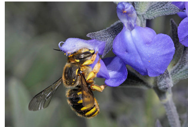
Figure 15. Anthidium manicatum foraging on germander sage ( Salvia chamaedryoides ).