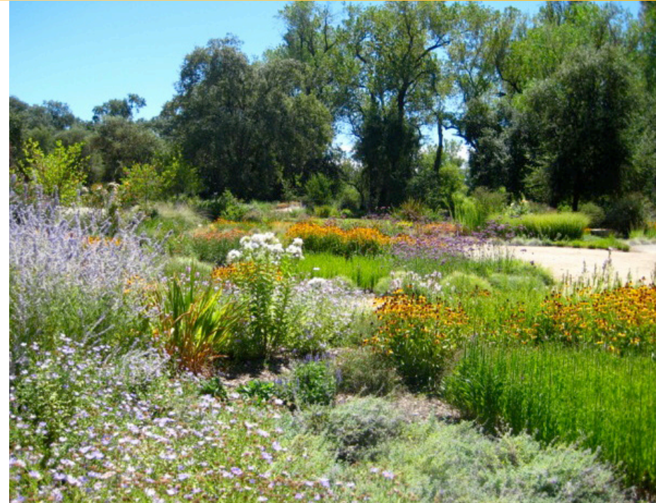
Figure 8. Turtle Bay's McConnell Arboretum and Botanic Gardens (Redding) in late summer 2009.