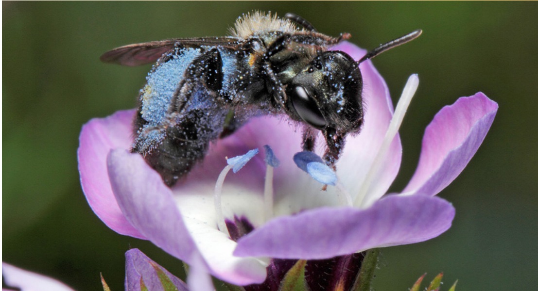
Figure 11. Andrena nigrocaerulea foraging on spring flowering bird's-eyes ( Gilia tricolor ).