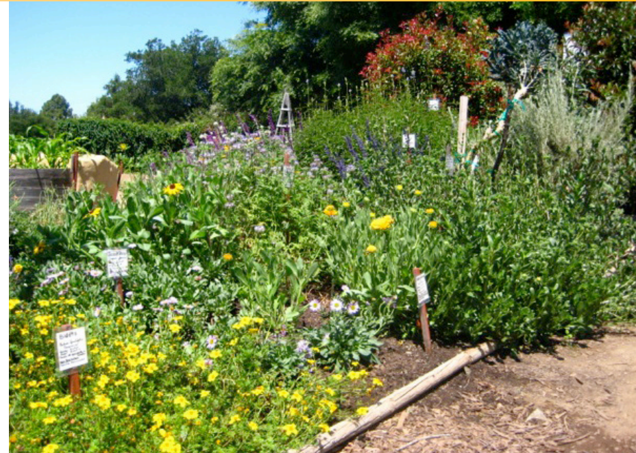
Figure 9. The Emerson Park Community Garden (San Luis Obispo) native bee plot in summer 2009.