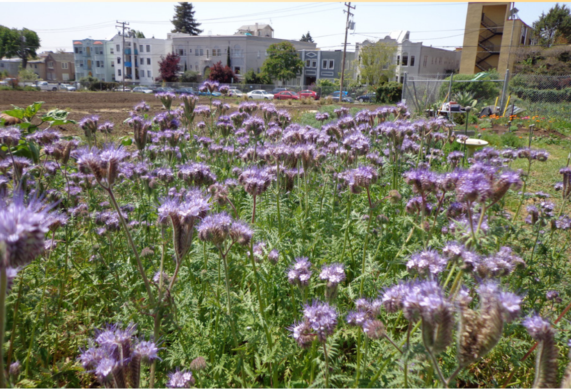
Figure 3. A large patch of Phacelia tanacetifolia at the Oxford Tract Bee Flower Evaluation Garden (Berkeley) in spring 2013.

fall in order to take advantage of the winter rains. In cool-summer climates, they can also be planted in February and March. Summer-blooming annuals like cosmos ( Cosmos bipinnatus , C. sulphureus ) and sunflowers ( Helianthus annuus ) can be planted when the danger of frost has passed in April or May. Lightly scratch the surface of the soil with a rake or fingers, then sprinkle the seeds on generously. Next, sprinkle a layer of soil on top of the seeds to keep them from blowing away or washing away when watering. Water gently and keep the seeded ground consistently moist. Most annuals benefit from the addition of compost before planting and will, as a result of this, reward the bees with a longer blooming season. Allow annuals to drop their seeds after flowering is finished to encourage reseeding for the following year. Transplants can be more convenient and can be planted in the same seasons as the seeds. Many hard-to-find annual native plant seedlings can be mail ordered or purchased at selected nurseries.