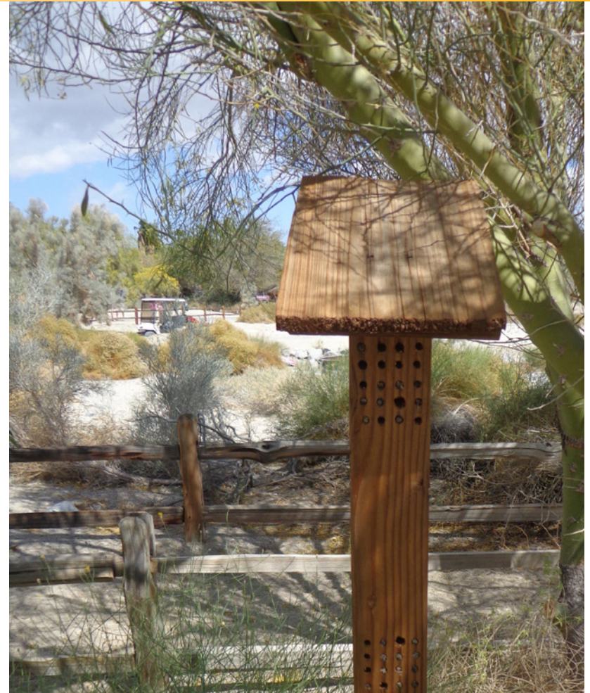
Figure 2. A native bee condo at the Living Desert, Palm Desert, California.

The female solitary bee builds an individual nest by digging a tunnel in the ground or selecting a pre-existing cavity such as those made by boring moth and beetle larvae. The young will develop in the nest for several months before they emerge as adults the following year. Approximately 70% of native bees nest in the ground and 15 to 20% nest in crevices and cavities. The remainder are “cuckoo” bees, meaning that, like the cuckoo bird, they do not have nests of their own. Instead, they take over the nests and collected resources of other bees, co-opting them for use by their own young. You can make an inviting “bee condo” for cavity-nesting bees by drilling holes in untreated wood or bundling paper straws together (figure 2).