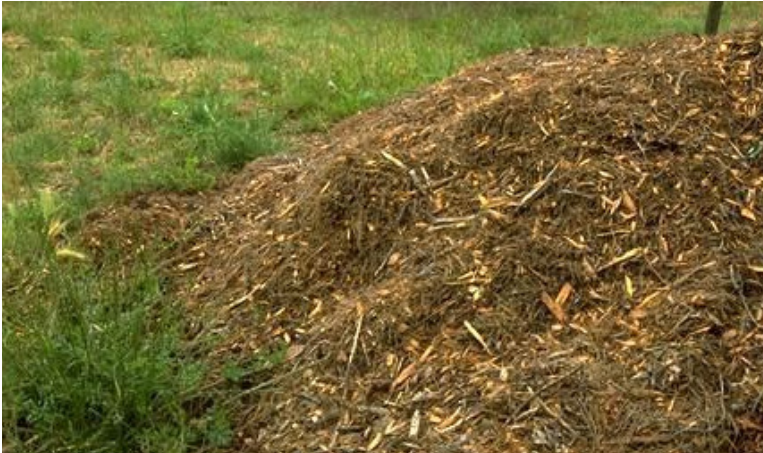
Figure 2. Wood chips have a high C:N ratio (on the order of 600:1), while dairy manures have a lower ratio (on the order of 15:1). Of the two, woody composts decompose more slowly, but manure-based products supply more nitrogen.