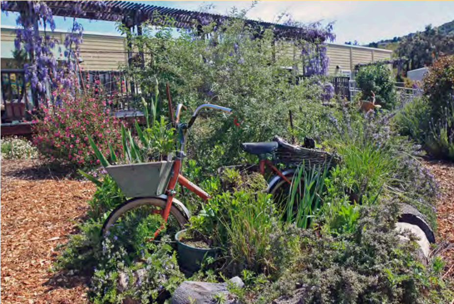
Figure 3. Marin Brain Injury Network Garden, Larkspur, California.