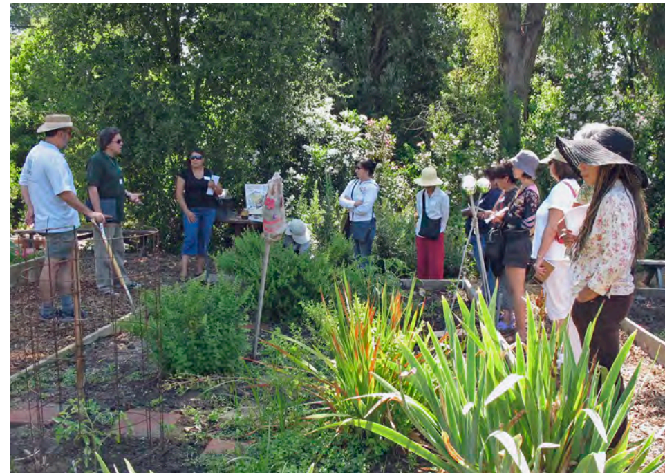
Figure 5. Descanso Gardens, Los Angeles, California.

Demonstration gardens are generally open for public visitation, and they are used in educational and recreational settings (figs. 4 and 5). These gardens are frequently used as hands-on classrooms or to host gardening workshops, native plant tours, and seminars on gardening-related topics such as water conservation, home vegetable gardening, or pollinator plantings. Many of these gardens have been developed by the University of California Master Gardener Programs located in individual counties.