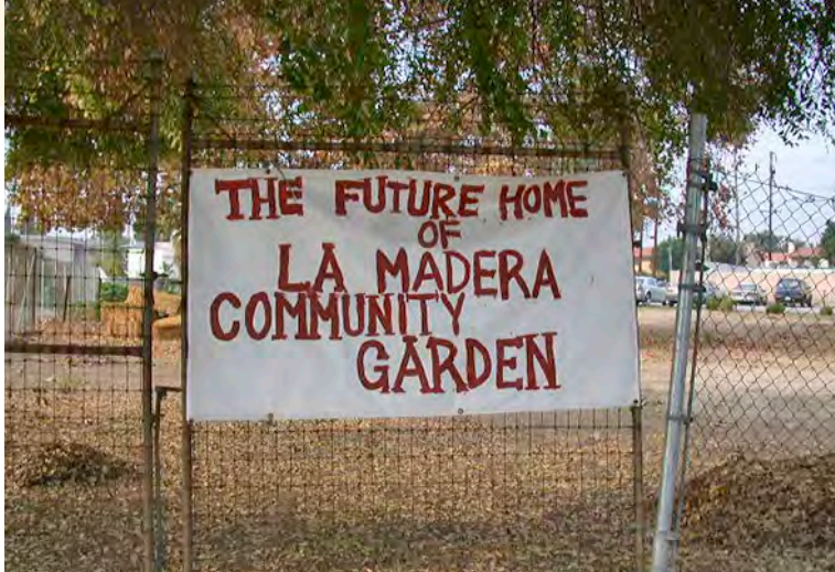
Figure 7. Finding garden space.

The garden committee normally has at least two officers—a president and a treasurer—although some may have more. In the event of committee turnover, it is helpful to have additional board members as a pool from which to fill vacated positions. Elections for garden officers usually are held annually.