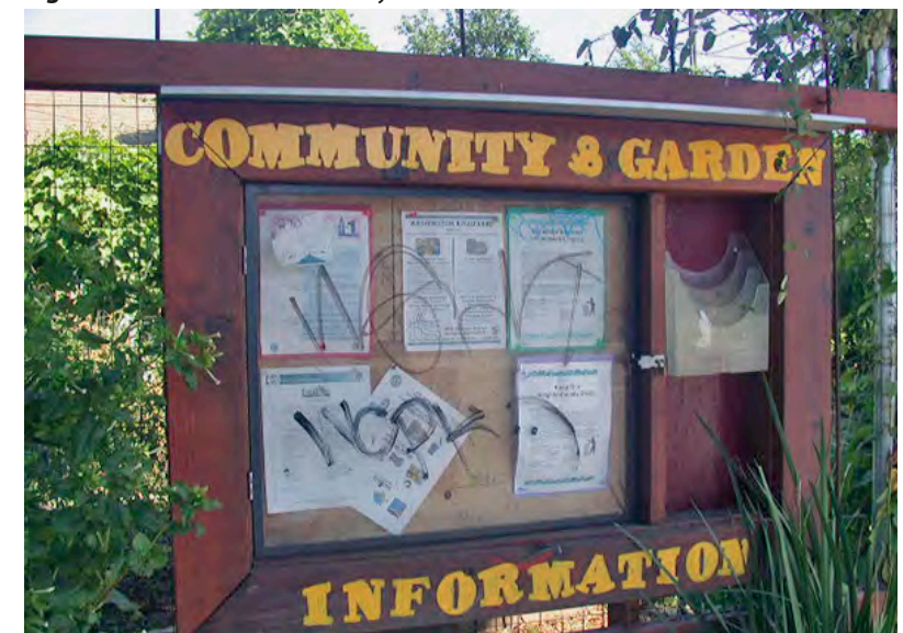
Figure 14. Graffiti on community board.

Most gardens experience occasional vandalism (fig. 14). The best action to take is to replant immediately. Generally the vandals become bored after a while and stop. Good community outreach, especially to youth and the garden's immediate neighbors, is also