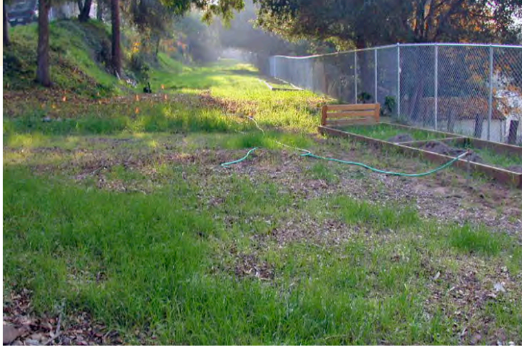
Figure 9. Early garden planning.