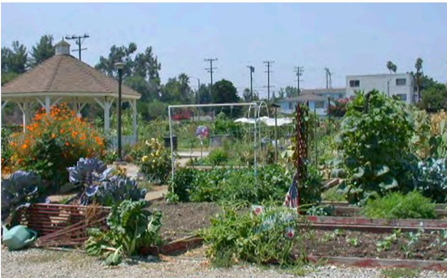
Figure 1. Alhambra Community Garden, Los Angeles, California.

Virtually all community gardens fit into one (or sometimes more) of the following five categories: neighborhood, school, institutional, residential, or demonstration gardens.