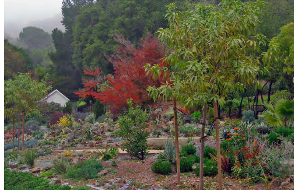
Figure 4. Falkirk Succulent Garden, San Rafael, California.