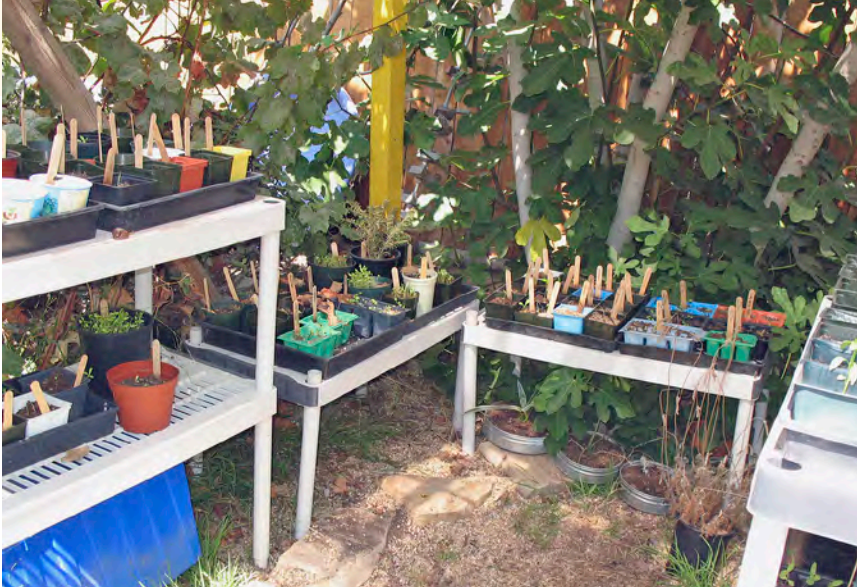
Figure 11. Starts on garden racks.