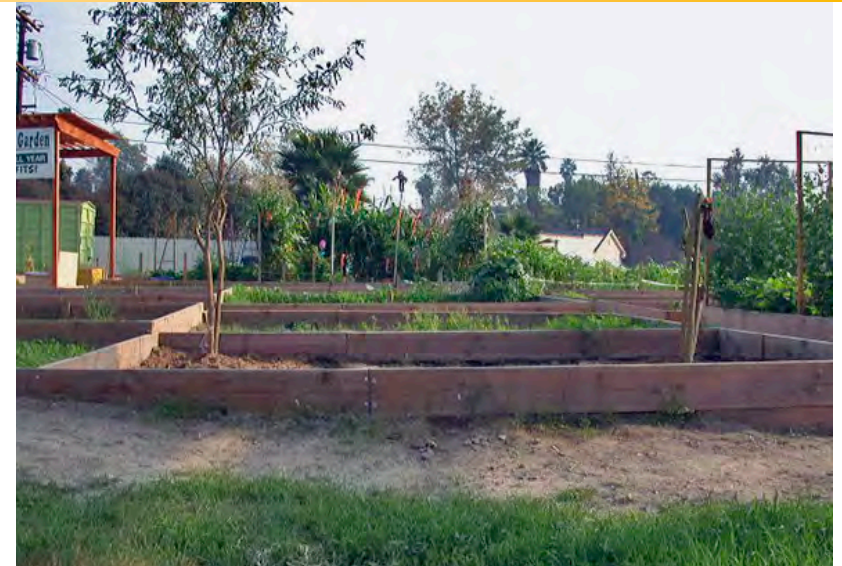
Figure 10. Garden parcels.

organic matter content. Check with other community gardens in the area about where they get their soil and compost amendments. Local landscape supply companies are typical sources. The local Master Gardeners chapter of the UC Cooperative Extension will also have information. Be aware that imported soils can mean imported weeds.