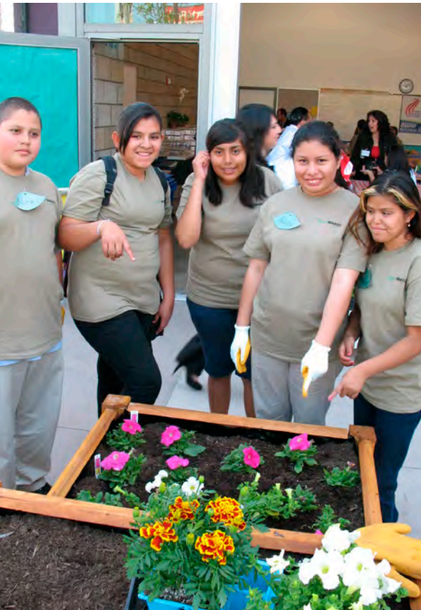
Figure 6. Roy Romer Middle School, North Hollywood, California.