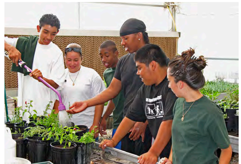
Figure 8. Youth watering transplants.

Existing access to water will make a critical difference in the expense of getting the project started (fig. 8). Depending