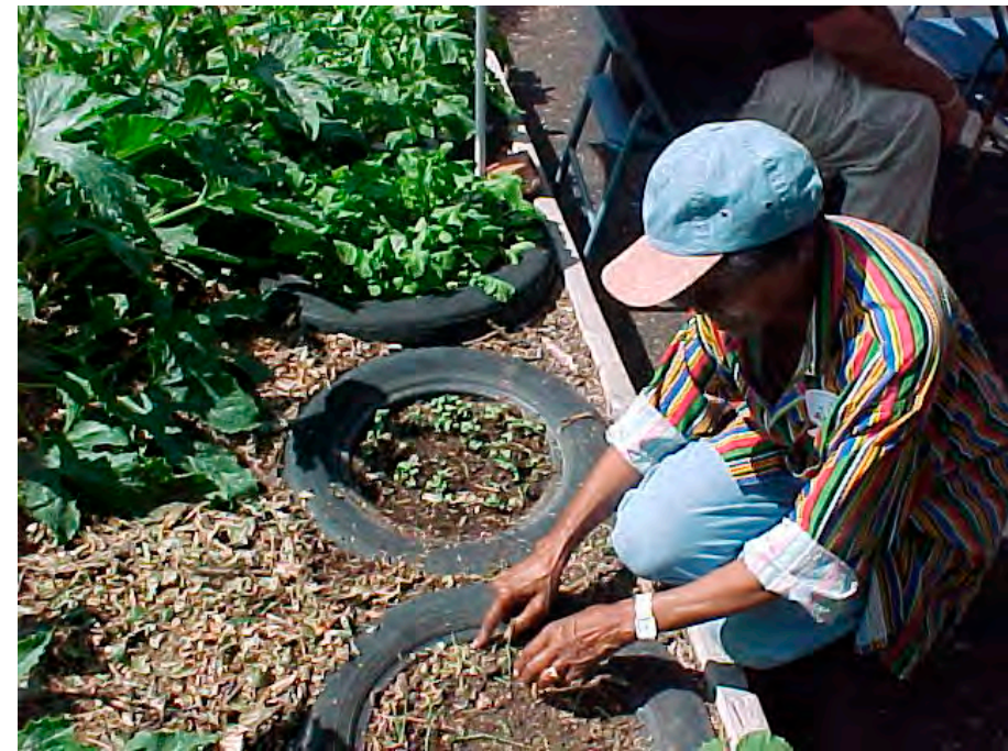
Figure 2. Residential garden, Los Angeles, California.

Residential gardens are typically shared among residents in apartment communities, assisted-living facilities, and affordable-housing units. These gardens are mainly cared for by residents living on the grounds, and they closely resemble neighborhood gardens where individual or communal plots are available to residents (fig. 2).