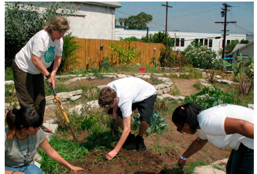
Figure 13. Preparing growing beds.

Many new garden groups make the mistake of remaining in the planning, designing, and fund-raising stage for an overly long period of time. A fine line exists between planning well and overplanning. After several months of the initial research, designing, planning, and outreach efforts, group members will very likely feel frustrated and begin to wonder if all their efforts will ever result in a garden. That's why it's important to prepare growing beds and plant something as soon as possible (fig. 13). People need to see visible results or they