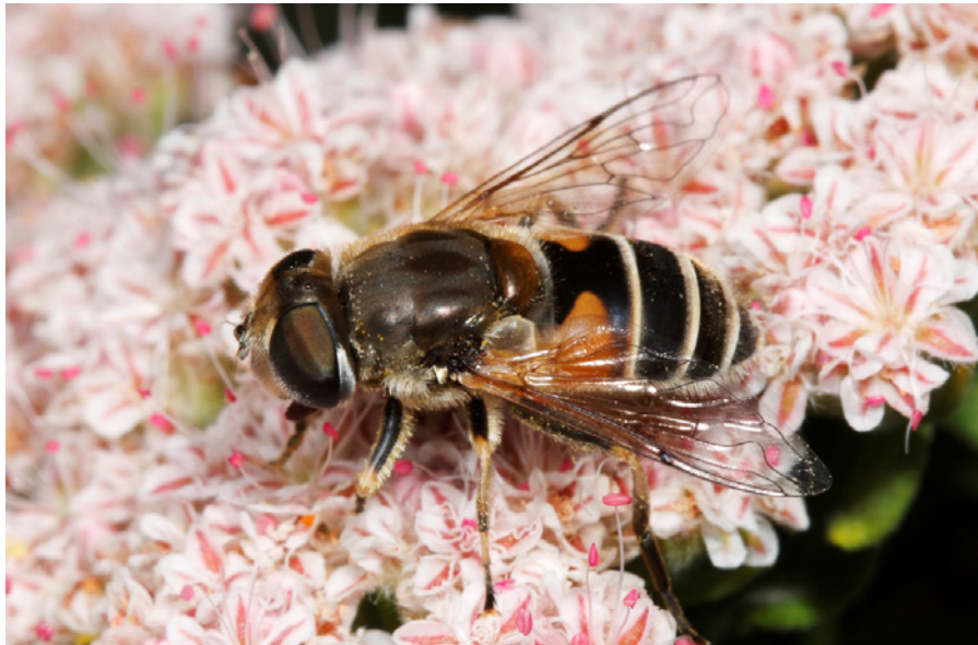
Figure 6. The common hover fly ( Eristalis arbustorum ) visiting Eriogonum .

The importance of conserving a diversity of pollinators has become more apparent as the introduced European honey bee population has declined due to colony collapse disorder (CCD). Unique to honey bee colonies, CCD causes worker bees to suddenly and mysteriously disappear. Single hive losses ranging from 30 to 100 percent have been reported by beekeepers in both North America and Europe (Nordhaus 2011). Honey bees are relatively inexpensive, and the industry standard when experiencing large hive losses is to order additional hives. A growing concern, however, is that if hive losses continue to increase, demand for honey bees will become too great to sustain. What will not decrease is flowering plants' need for successful pollination from their associated pollinator(s). While scientists still do not know the exact cause(s) of CCD, they do know that managed honey bees are subjected to a number of stressors, such as pesticide poisoning, low food-source