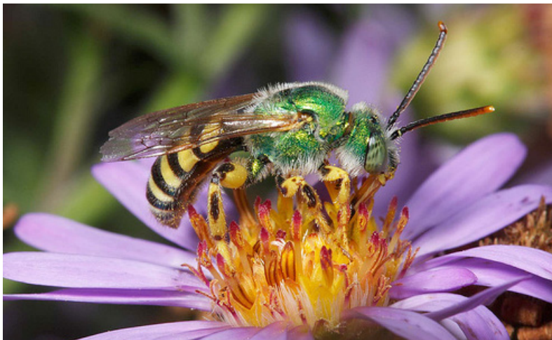
Figure 1. Male of Agapostemon texanus visiting Aster sp.

The relationships that exist between flowering plants and pollinators are not casual, as many plants and pollinators have coevolved over long periods of time to efficiently exchange services. Pollination of flowers by pollinators is the unintended outcome of their activity on the flower. As pollinators visit flowers to sip nectar