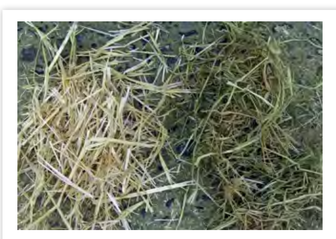
Figure 1. The traditional straw used in dairy heifer rations, wheat straw (left), is shown alongside cutter-baled rice straw (right).

Recent increases in feed costs have prompted dairy owners and nutritionists to explore new ways to optimize rations for growing heifers. In free-choice rations, dairy operators often use forages and wheat straw to provide bulk and limit feed intake. The use of rice straw, produced in high quantities in the Sacramento and northern San Joaquin Valleys, has been part of our research on dairy heifer rations since 2004. In our studies we have learned a lot about how to make rice straw a valuable feed in heifer rations as well as ways to overcome the main hurdle that has made it hard to use: incorporation of long rice straw stems into Total Mixed Ration (TMR) mixers requires substantially longer mixing times and often damages mixing equipment, necessitating shutdowns and repairs.