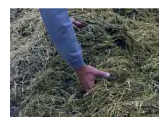
Figure 2. Cutter-baled rice straw that has been evenly mixed into the Total Mixed Ration (TMR).