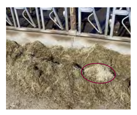
Figure 3 . Flail-chopped rice straw causes uneven mixing.