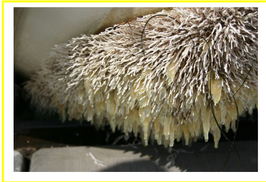
Tubeworms ( Hydroides sp. ) and Sea Squirts ( Ciona sp. )