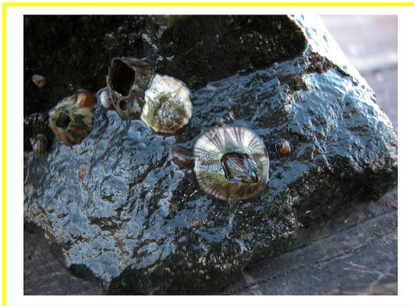
Barnacles ( Balanus amphitrite )