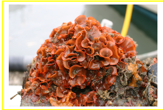
Bryozoan ( Watersipora subtorquata )