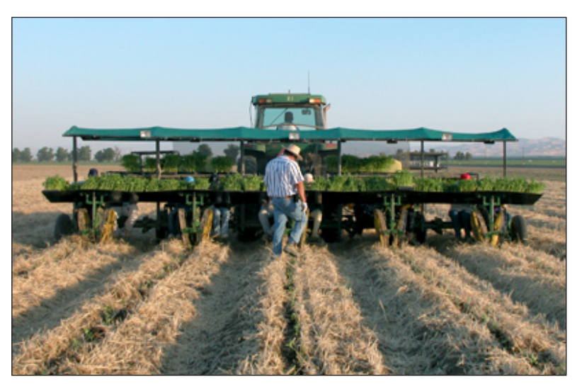
Figure 9. Transplanting fresh-market tomatoes in conservation tillage field, Sun Pacific Farms, Firebaugh, California, 2003.