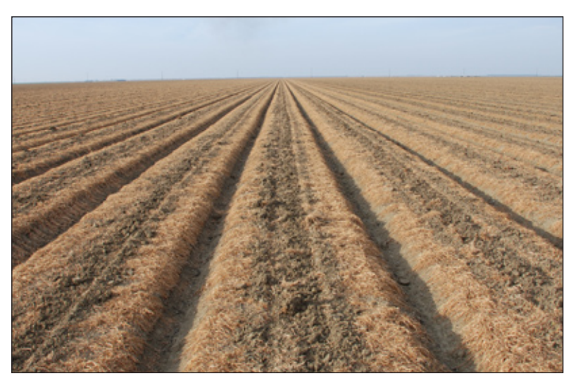
Figure 12. Strip-tilled triticale cover crop beds, Sano Farms, Firebaugh, California, 2008.