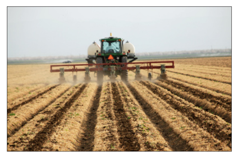
Figure 11. Strip-tilling centers of processing tomato beds in conservation tillage field, Sano Farms, Firebaugh, California, 2008.

However, in the 2003 trial, CT yielded 12 tons per acre more than ST. Using a crop value of $54.40 per ton, the gross return was higher by $756 per acre with CT. Custom harvest is charged on a per ton basis; therefore, the higher yield in 2003 for CT resulted in an additional harvest cost of $126 per acre. The increase in revenue per acre offset by the increase in harvest cost meant an increase in net returns over harvest cost of $630 per acre. Adding the savings in cultural costs and overhead costs ($106) to the increase in revenue adjusted for the increase in harvest cost ($630) gives a bottom line of an increase in profit of $736 per acre for CT.