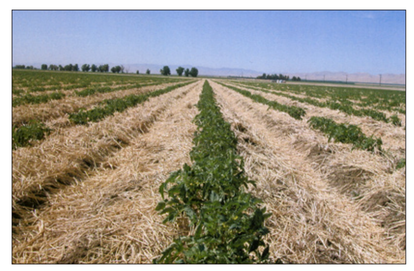
Figure 13. Strip-tilled transplanted fresh market tomatoes in barley cover crops, Sun Pacific Farms, Firebaugh, California, 2003.