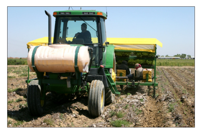
Figure 6. Transplanting tomatoes into "unworked" cotton beds from previous season in Five Points, California, conservation tillage study, 2005.

Note: Letters following each yield number indicate whether there were statistically significant differences between treatments within a given year; different letters in a particular column indicates that the systems likely had significant differences in yield.