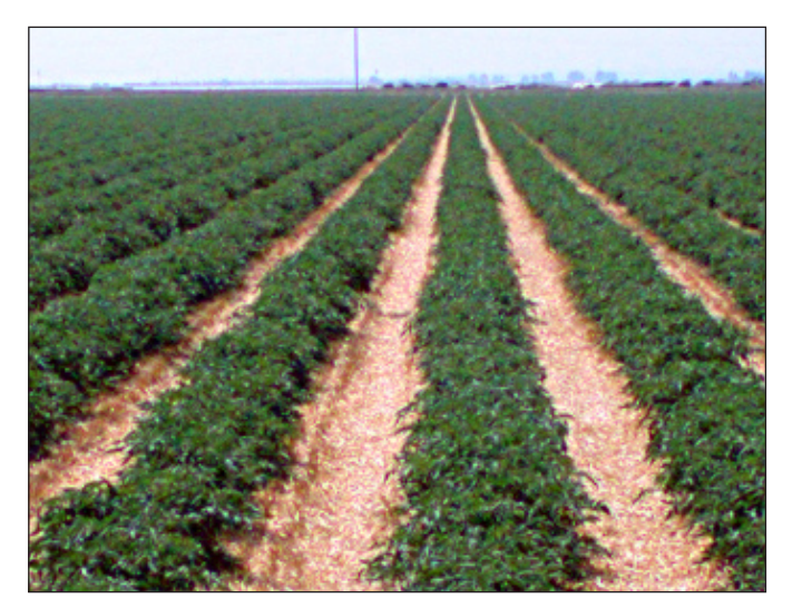
Figure 15. Fresh-market tomato field with barley cover crop residue, Firebaugh, California, 2003.