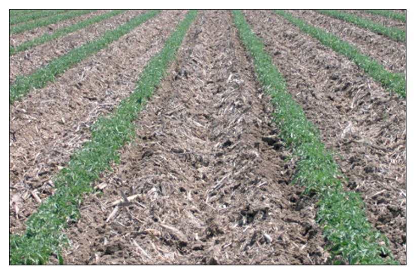
Figure 7. Cultivated processing tomatoes in Davis, California, conservation tillage study, 2004.

cleaning mechanism before the product entered tomato transport trailers.