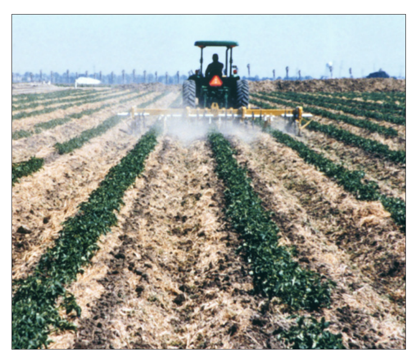
Figure 3. High-residue cultivation of strip-till transplanted processing tomatoes, Tracy, California, 1999.

Table 1. Processing tomato yields from 1999 on-farm demonstration in Tracy, CA,and 2000 demonstration in Vernalis, CA