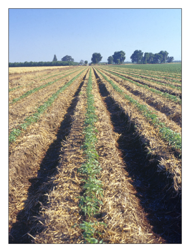
Figure 2. Strip-till transplanted fresh market tomatoes in wheat cover crop, Le Grand, California, 2001.

Minimum-till systems for tomatoes that rely on reduced-pass bed preparation and that disturb a far greater soil volume than is done in CT are discussed in a companion publication in this series, Minimum Tillage Vegetable Crop Production in California (Mitchell et al. 2004).