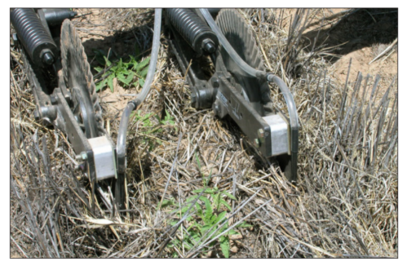
Figure 5. Applying liquid fertilizer as a side-dress to fresh market tomatoes in Parlier, California, conservation tillage study, 2002.

management operation, so they were reworked using furrow sweeps at transplanting and during in-season cultivations (see fig. 1). In the CT cover crop systems, the cover crop was sprayed with glyphosate, chopped, and left on the soil surface as a mulch before transplanting tomatoes or planting cotton (see fig. 2). A summary of pretomato tillage operations used in each system is shown in table 2.