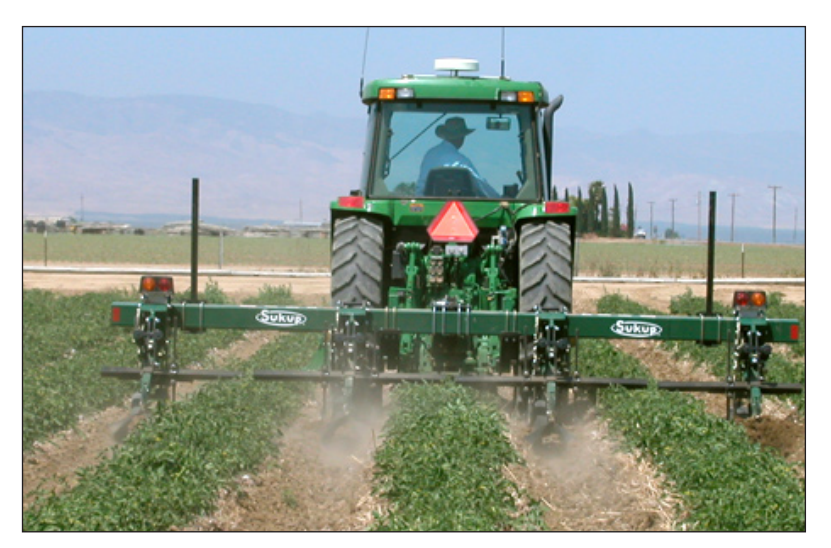
Figure 4. Cultivating no-till transplanted processing tomatoes in Five Points, California, conservation tillage (high residue) study, 2004.