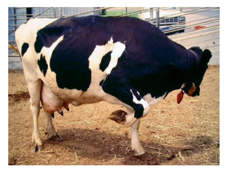
Figure 4. A cow exhibiting fly-repelling behaviors, including tail flicking, foot stamping, and head tossing to dislodge biting stable flies.

Assessing fly-repelling behaviors. Because the fly-repelling behaviors of cattle increase with stable fly attack rates, you can also use the prevalence of these behaviors to gauge fly abundance (Mullens et al. 2006). Fly-repelling behaviors include flicking the tail, stamping the feet, throwing the head back toward the legs or torso, and rippling the skin (panniculus reflex) (fig. 4). Horse flies and horn flies may trigger these behaviors as well, so it is important to determine that the cattle are in fact responding to stable flies.