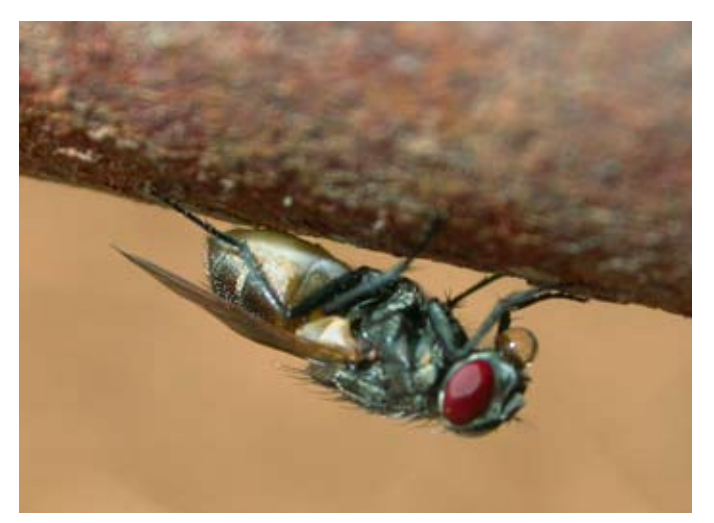
Figure 2. Adult house fly resting. Note that the body is parallel to the resting surface. A regurgitated droplet may be used for evaporative cooling in hot weather.