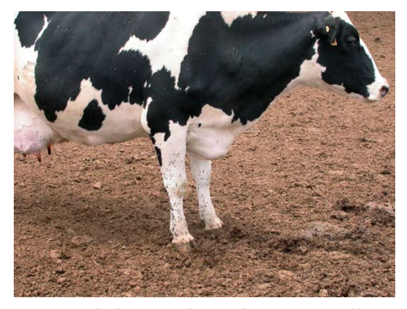
Figure 3. Stable flies feeding on the front legs of a cow. The presence of flies on the lower legs of cattle and resulting agitation of the cattle are diagnostic for stable fly.

When pest abundance is low, the economic and health costs associated with the pest are typically low, too. However, as pest population numbers increase they will eventually pass an abundance value (the economic injury threshold ) beyond which the pests will cause unacceptable economic or health costs, and control efforts directed against the pests will be warranted. The goal of every pest management program is to keep pest population levels below the economic injury threshold, and so keep operating costs low.