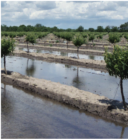
Figure 3. Orchard border irrigation.