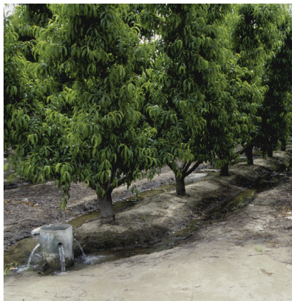
Figure 4. Orchard furrow irrigation.