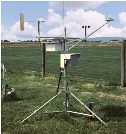
Figure 1. CIMIS station.