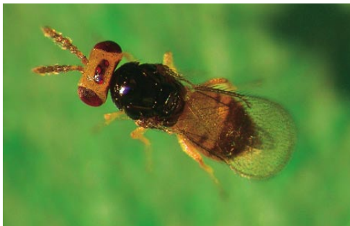
Figure 22. A parasitic wasp ( Aprostocetus vaquitarum ) that attacks Diaprepes eggs.

A number of species of small parasitic wasps that attack the egg stage of the Diaprepes root weevil were collected from the Caribbean and released in Florida from 1998 to 2001 (Hall et al. 2001). Two of the parasites, Aprostocetus vaquitarum (fig. 22) and Quadrastichus haitiensis , have become established. The levels of parasitism in southern Florida range from 70 to 80 percent. However, in central Florida, parasitism is only 5 percent. This variability may be due to differences in winter temperature or differences in application of various pesticides.