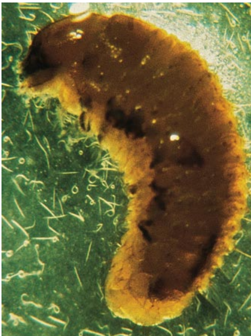
Figure 23. Diaprepes larva killed by nematodes.

Entomopathogenic nematodes, both native and commercially available, have been found to cause significant mortality to Diaprepes root weevil larvae in sandy soils in Florida and the Caribbean (McCoy et al. 2000) (fig. 23). The nematodes are ineffective in heavier, clay loam soils with a small particle size. This lack of effectiveness may be due to the inability of the nematodes to move through the smaller pore spaces found in the heavier soils.