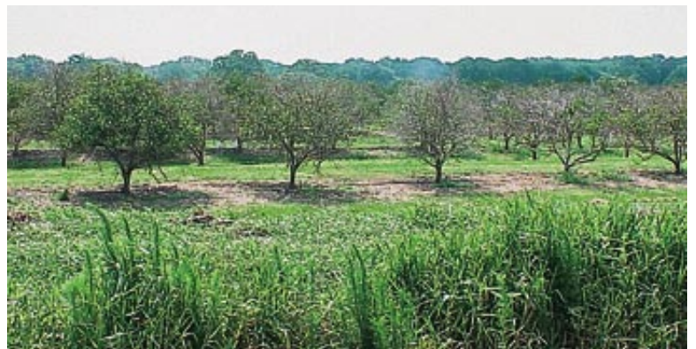
Figure 18. Citrus trees declining due to a heavy infestation of Diaprepes root weevil in Osceola County, Florida.

Larvae of the Diaprepes root weevil cause extensive damage to their host plants by feeding on the roots, tubers, or other underground portions. In cassava and potatoes, the larvae feed directly on the tubers (figs. 14–15). In citrus, they begin by feeding on the smallest roots, and as the larvae grow, they move to the larger structural roots (fig. 16). Eventually they may girdle the large lateral roots or the crown area of the tree (fig. 17). In laboratory studies, citrus rootstocks commonly used in the United States showed no resistance or tolerance to feeding by Diaprepes root weevil larvae. Many citrus trees do not show symptoms of decline (e.g., leaf yellowing, wilting, defoliation, etc.) until extensive damage has been done to the root system (fig. 18). Damage is particularly serious in groves where trees are planted in poorly drained soils that