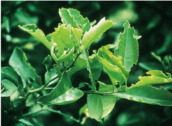
Figure 8. Citrus leaf feeding by Diaprepes adults.