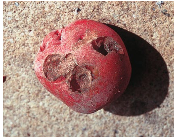
Figure 15. Larval feeding on potato.