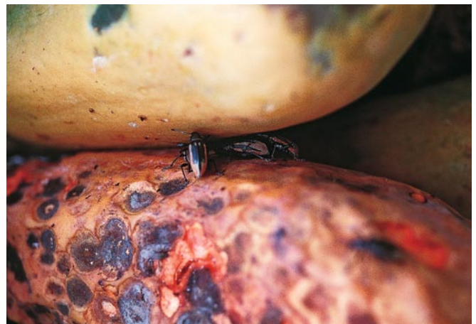
Figure 11. Papaya fruit feeding by adults.

Adult Diaprepes weevils feed along the edges of leaves, creating semicircular notches (figs. 8–10). They prefer young, tender leaves over older leaves. On rare occasions, adults may feed on fruit. Fruit feeding is usually limited to papaya (fig. 11) and citrus (fig. 12). Damage caused by adult weevils is similar to damage caused by other citrus weevils such as Fuller rose beetle ( Asynonychus godmani ), so it is important to locate and identify the weevil that is causing the damage. In addition to notching, Diaprepes adults leave frass scattered on the leaves (fig. 13). Adults are sometimes difficult to find because they feed during the early morning and late afternoon, hiding in the foliage during the day. However, they may be dislodged by shaking the foliage over a light-colored cloth. The trees on which the feeding damage is seen are the trees that should be sampled. In citrus groves with well-established populations, weevils may be found on every tree or sometimes aggregated on just a few trees.