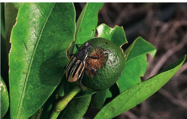
Figure 12. Citrus fruit feeding.