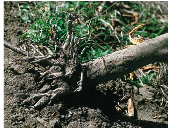
Figure 17. Eventually, Diaprepes may girdle the crown of citrus.