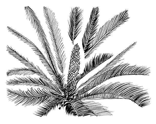
Figure 1. The male "flowers" (microsporophylls) of the sago develop on a large, upright cone in the center of the plant.

Cycads are dioecious, meaning that there are separate male and female plants. Plants of both sexes must be within fairly close proximity in order to produce seed. During pollination, spermatozoids produced by the male plant fertilize the ovules of the female plant. The male "flowers" (microsporophylls) develop on a large upright cone in the center of the plant (fig. 1), while the female "flowers" (megasporophylls) are generally lower, forming a round, somewhat flattened globe also in the center of the plant (fig. 2).